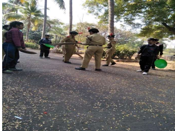
MAHA SWACHHATA ABHIYAN

Motto of NCC Unity and Discipline एकता और अनुशासन