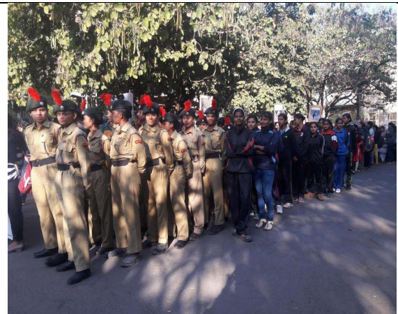
ANTI DRUG RALLY