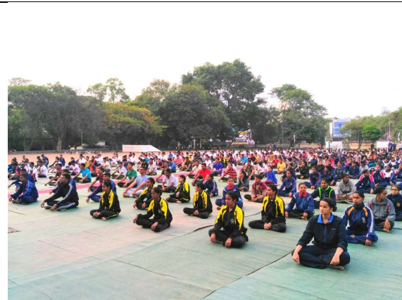
INTERNATIONAL YOGA DAY, AIPT, HADAPSAR