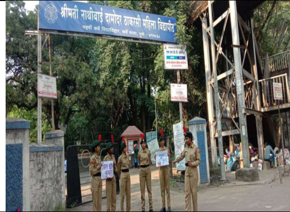
SKIT OF WET & DRY WASTE MANAGEMENT (OLA KACHRA & SUKHA KACHRA)