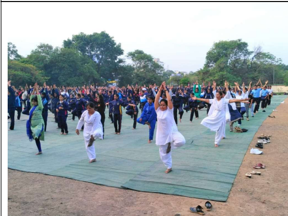
INTERNATIONAL YOGA DAY AIPT, HADAPSAR