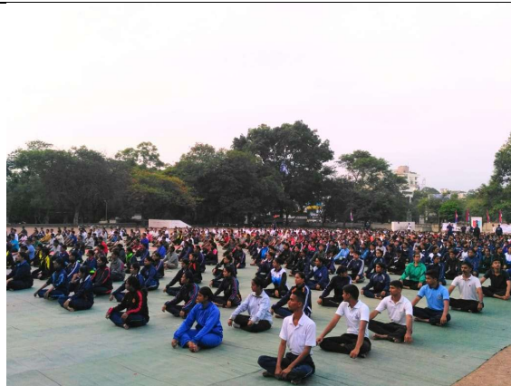
INTERNATIONAL YOGA DAY, AIPT, HADAPSAR