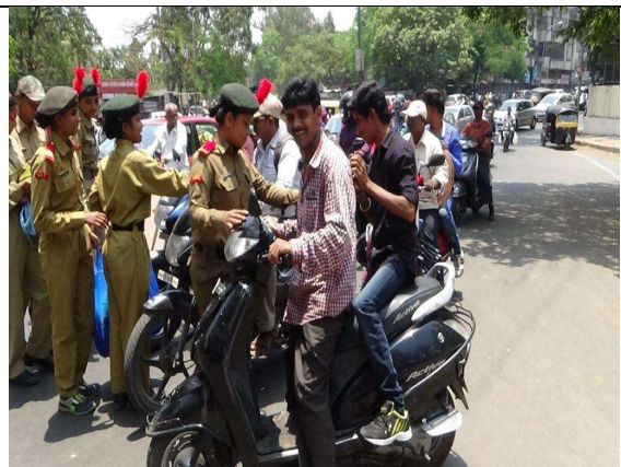
PAPER BAG MAKING & DISTRIBUTION

Motto of NCC Unity and Discipline एकता और अनुशासन