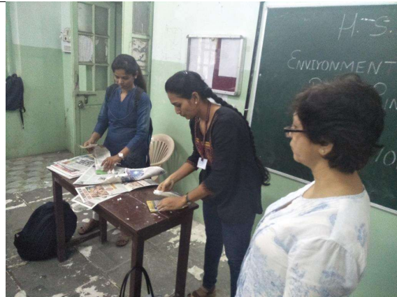
PAPER BAG MAKING & DISTRIBUTION