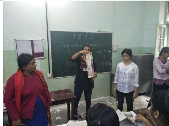
PAPER BAG MAKING & DISTRIBUTION