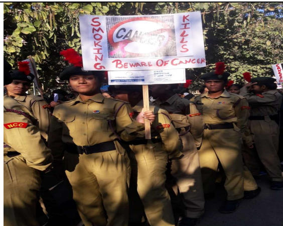
ANTI DRUG RALLY