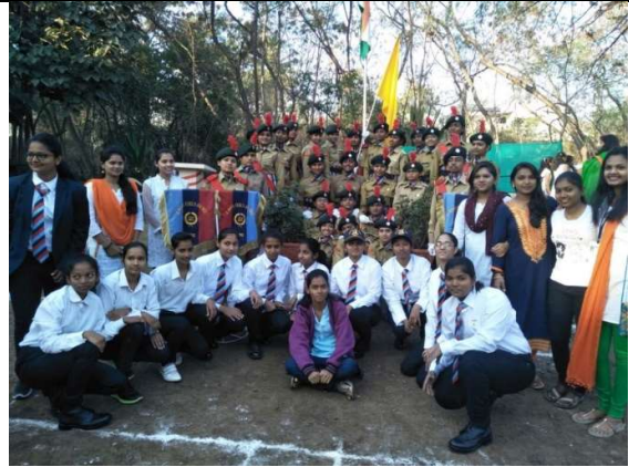
REPUBLIC DAY FLAG HOSTING & CEREMONIAL DRILL