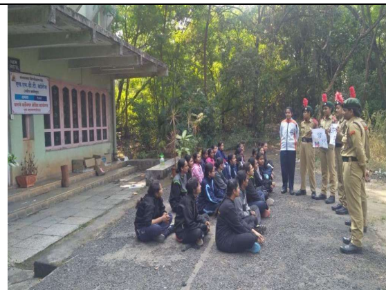
SKIT OF WET & DRY WASTE MANAGEMENT (OLA KACHRA & SUKHA KACHRA)