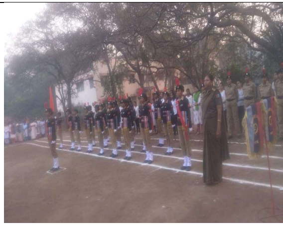
REPUBLIC DAY FLAG HOSTING & CEREMONIAL DRILL