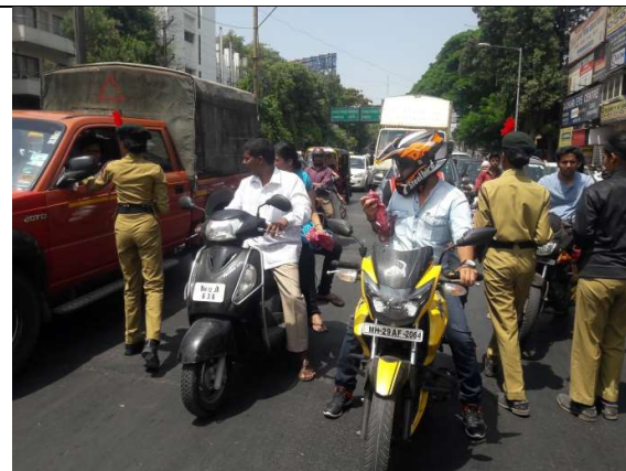
PAPER BAG MAKING & DISTRIBUTION