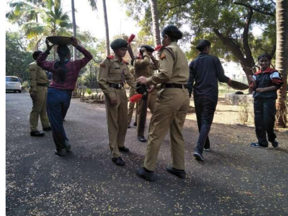
MAHA SWACHHATA ABHIYAN