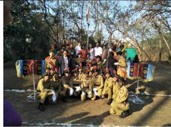
REPUBLIC DAY FLAG HOSTING & CEREMONIAL DRILL