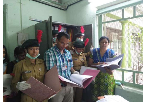
MAHA SWACHHATA ABHIYAN