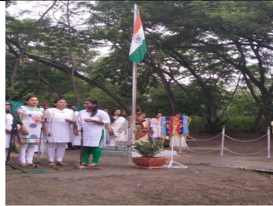
INDIPENDANCE DAY FLAG HOSTING & CEREMONIAL DRILL