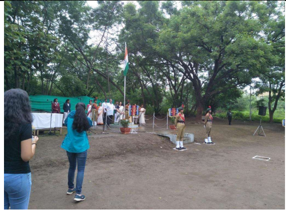
INDIPENDANCE DAY FLAG HOSTING & CEREMONIAL DRILL