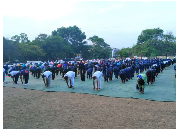
INTERNATIONAL YOGA DAY, AIPT, HADAPSAR

Motto of NCC Unity and Discipline एकता और अनुशासन