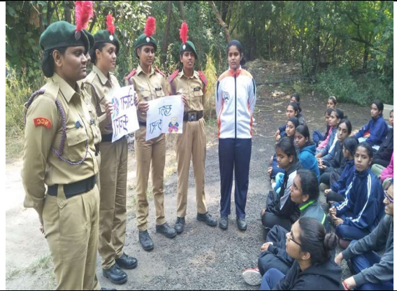
SKIT OF WET & DRY WASTE MANAGEMENT (OLA KACHRA & SUKHA KACHRA)