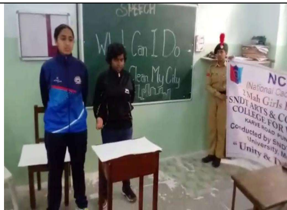
SKIT OF WET & DRY WASTE MANAGEMENT (OLA KACHRA & SUKHA KACHRA)

Motto of NCC Unity and Discipline एकता और अनुशासन