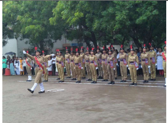
INDIPENDANCE DAY FLAG HOSTING & CEREMONIAL DRILL