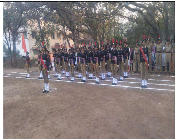
REPUBLIC DAY FLAG HOSTING & CEREMONIAL DRILL