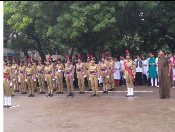
INDIPENDANCE DAY FLAG HOSTING & CEREMONIAL DRILL