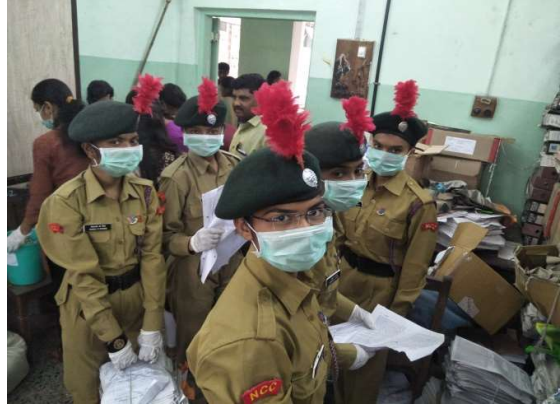
MAHA SWACHHATA ABHIYAN